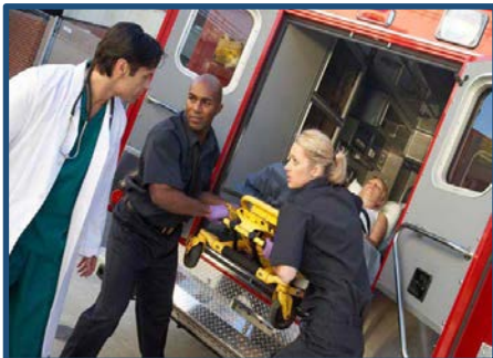
Healthcare MSU Billings City College & Career Center Paramedicine Apprenticeship Program