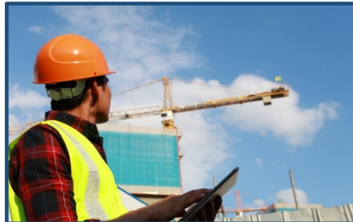
Construction Trades Miles Community College & Missoula College Construction Technology Apprenticeship Program