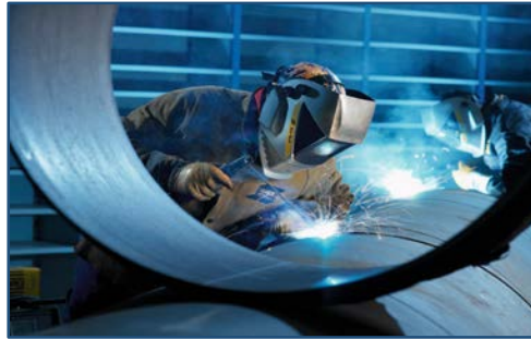
Manufacturing Great Falls College - MSU Welding & Metal Fabrication Apprenticeship Program