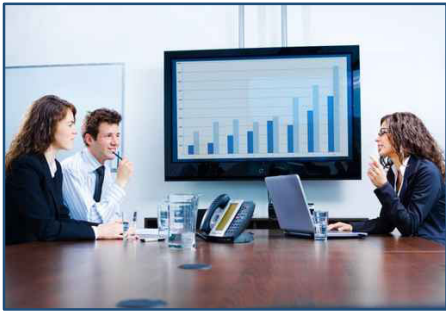
Finance Missoula College Accounting Technician Apprenticeship Program